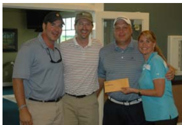
...and Runners Up